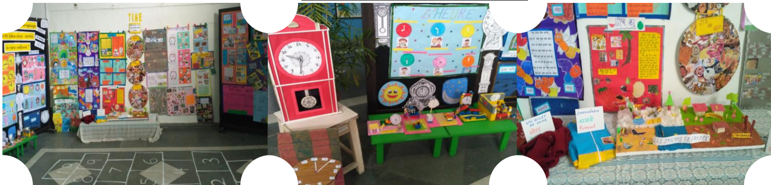
Board Display in the Atrium