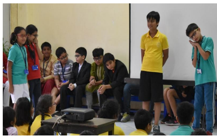
Students of Class 4