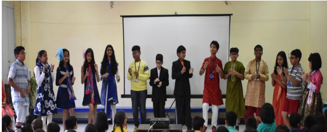
Students of Class 5