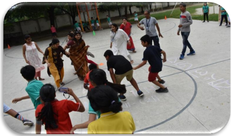
Teachers and Students enjoying a friendly match of 'Kho-Kho' and 'Pittu'