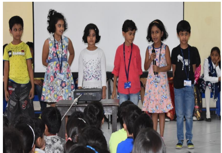
Students of Class 1