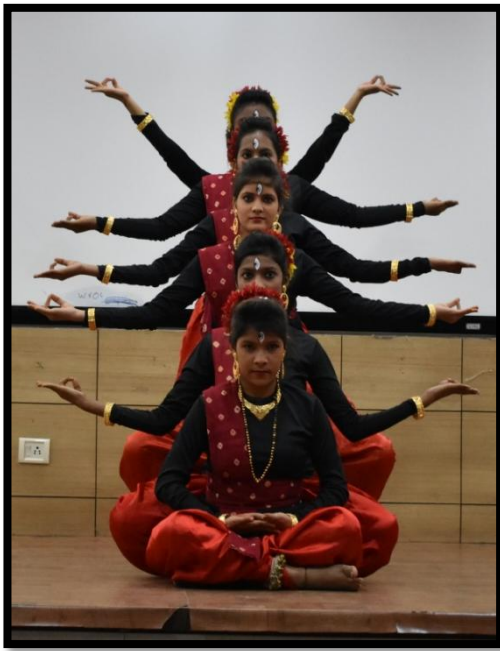
The pupils of Hope Kolkata Foundation performing their dance.