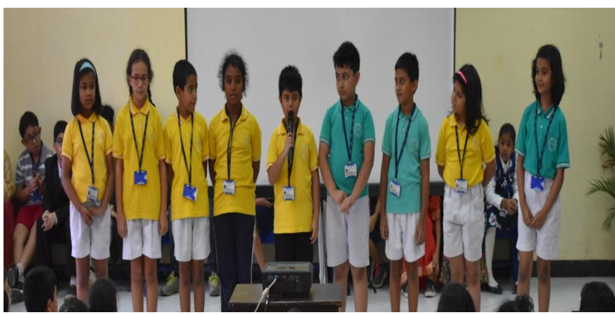
Students of Class 3