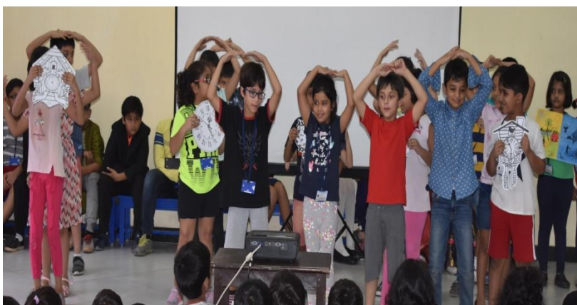
Students of Class 2